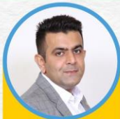
IMMEDIATE PAST PRESIDENT